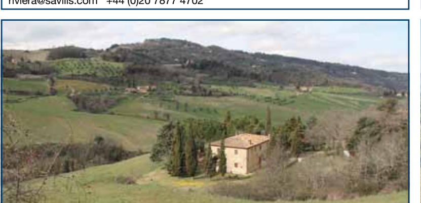
ITALY, TUSCANY, VOLTERRA

astorrie@savills.com +44 (0)20 7016 3866