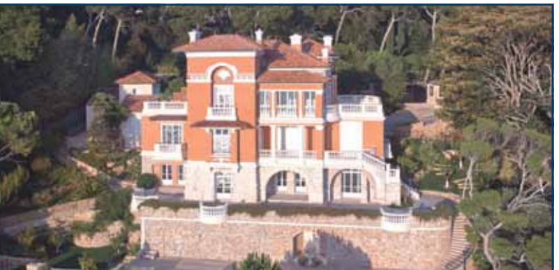
FRANCE, FRENCH RIVIERA, DOMAIN DU CAP MARTIN

Waterfont villa of 650 m² with direct sea access ◆ sought-after private domain ◆ sole agent lacktriangle pool and pool house lacktriangle panoramic sea views towards Monaco lacktriangle plot: 3,600 m² Guide €25 million