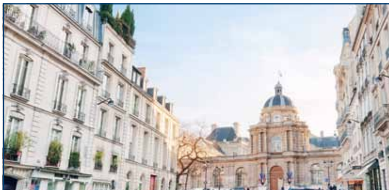
FRANCE, PARIS 6TH

astorrie@savills.com +44 (0)20 7016 3866