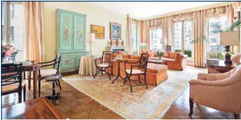
UNITED STATES, NEW YORK

◆ 2 parking spaces ◆ 1 bedroom apartment Guide €2.5 million jcvjetkovic@savills.com +44 (0)20 7016 3740