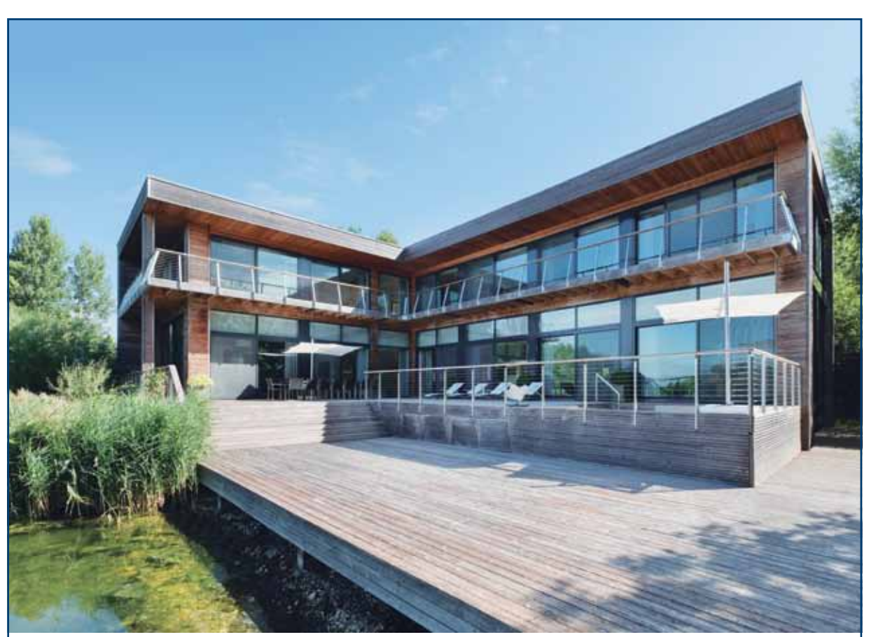
THE ULTIMATE IN LAKESIDE LIVING ENGLAND, GLOUCESTERSHIRE, NR LECHLADE

Savills International Alice Storrie astorrie@savills.com +44 (0)20 7016 3866