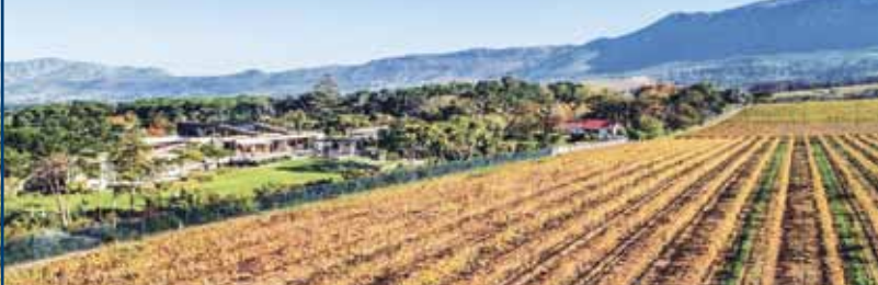
SOUTH AFRICA, WESTERN CAPE, CONSTANTIA

Superb 1 bedroom ground floor flat ◆ reception room ◆ bathroom ◆ a perfect home, pied a terre or investment ◆ share of freehold ◆ EPC=D Guide £625,000 mmsmith@savills.com +44 (0)20 3430 6860